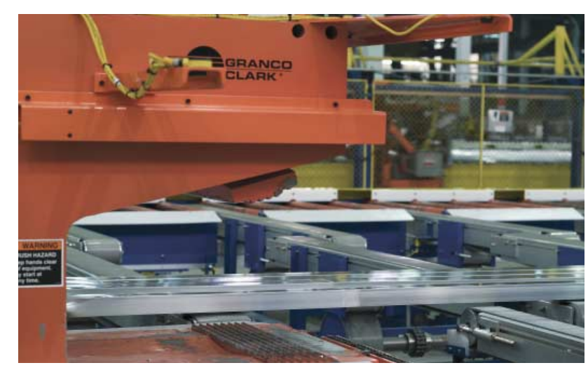
The stretcher jaws open to accept new profile batches...

The CVCS's vertical motion prevents the extrusion from getting "hung up" in the teeth of the jaw. This eliminates operational delays and reduces the need for manual intervention.