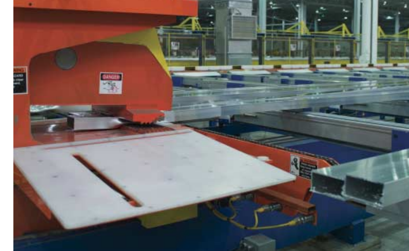
...then clamp down tightly to ensure precise, accurate stretching.