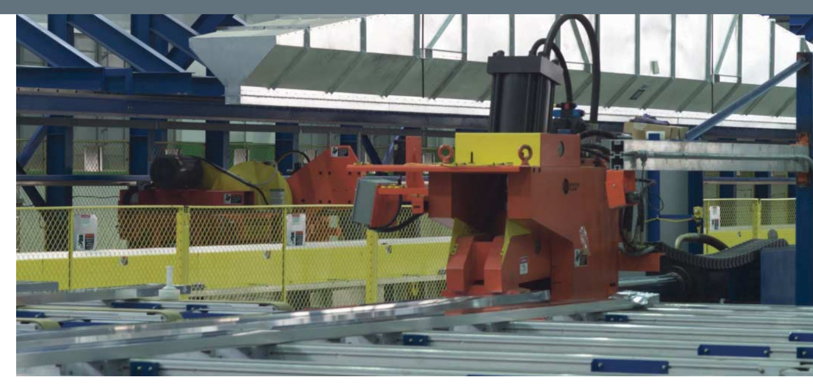
The Granco Clark Controlled Vertical Crush Stretcher delivers maximum gripping control with minimum distortion.

The safety of Granco Clark stretchers is unsurpassed in the industry. Three safety mats are positioned around the perimeter of the power-head end; any intrusion into this area immediately stops the stretcher. At both ends of the stretcher, light curtains protect the operator from injury by releasing the jaw if the curtain is penetrated. Two hands—one to activate, the other to confirm—are required to operate the stretcher jaws, insuring that both of the operator's hands are out of harm's way. If you prefer, an additional light curtain may replace the perimeter safety mats.